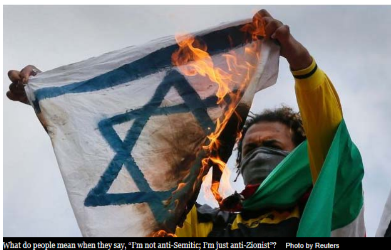
What do people mean when they say, "I'm not anti-Semitic; I'm just anti-Zionist"?

Since the beginning of the Gaza war, many Jews in Israel and the Diaspora have been shocked by the virulent anti-Zionism - also known as anti-Israelism - that has exploded online. Extending far beyond the legitimate act of critiquing Israel's wartime decisions, many recent blogs and social media posts have been full of hatred toward Zionism, Zionists and Israel. Because of this, some Israeli and Diaspora Jews feel that what were once friendly online social spaces for them have now become unpleasant, threatening, even unsafe. One woman blogged about how, in order to cope with this, she had "unfriended" many of her Facebook "friends."